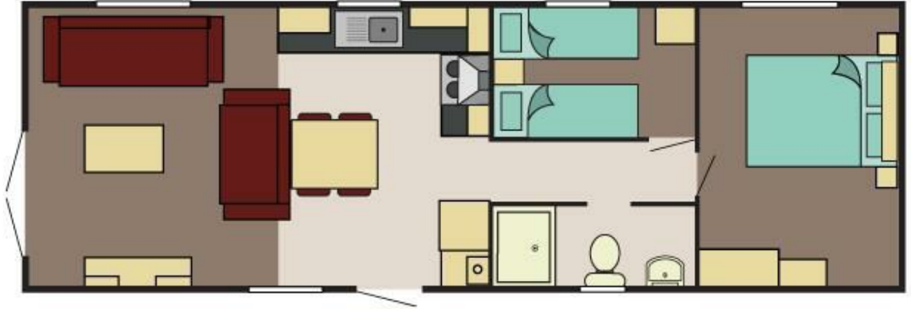
Saffron Deluxe 36x12 2 Bed